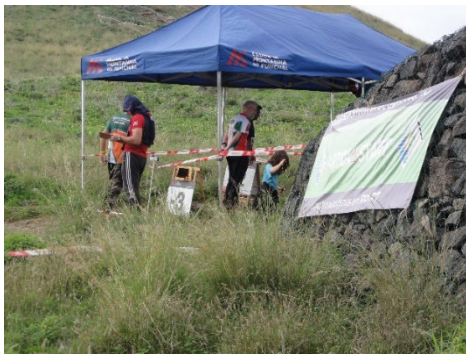
(Left) Ian at the start, volcano just visible in the background

I thought it was an interesting event, and well organised except for the mis-sited controls. It was good to have a cross-country event as part of an urban weekend for a bit of variety although it did mean having to travel with another pair of O' shoes. Afterwards, Ian and I headed back to the nearby village of Caniçal for a late lunch to fortify us for the City Race the following day.