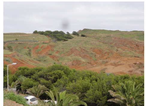
(Right) Area roughly to the north of the finish