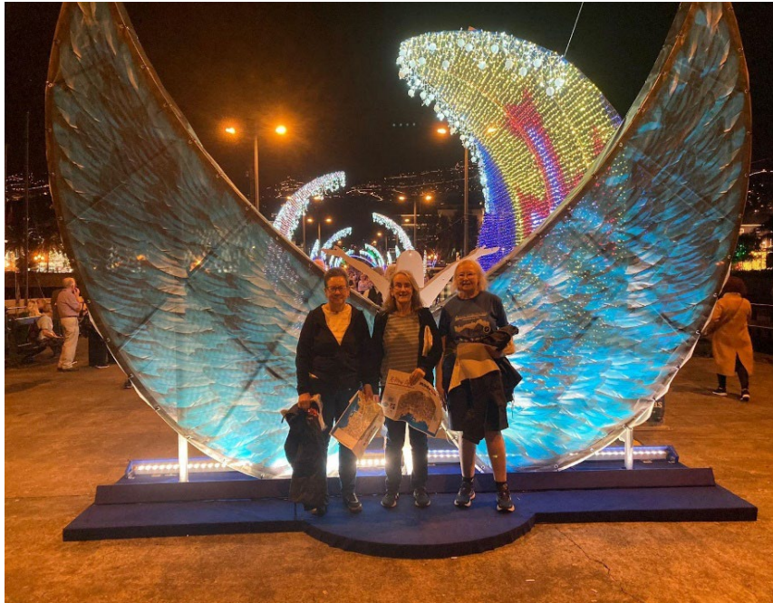
Angelic SMOCies near the last control.

visited but couldn't get my phone to scan and capture the code. There was also the problem of not having too much battery life on my phone.